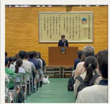
A TNUSS student welcomes elementary students and their parents at the Open School.