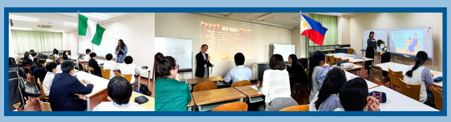
Listen to the TNUSS Voices Podcast anytime on <a href="https://www.tng.ac.jp/sec-sch/">www.tng.ac.jp/sec-sch/</a>.