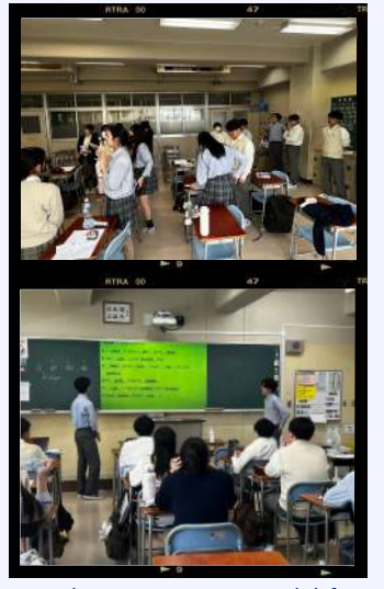
Students practice real-life conversations and build confidence for their upcoming trip to Hawaii.

The Language Education Development Department (LEDD) stepped in to help students prepare for Hawaii with a fun, hands-on class designed for both TNUSS and Tsuchiura Nihon University High School students.