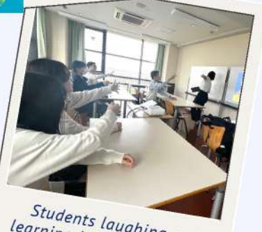
Students laughing and learning in Spanish class