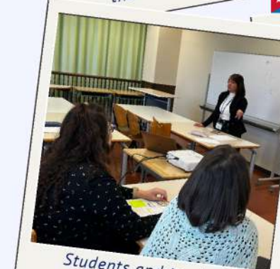
Students and teachers exploring unique Filipino English expressions