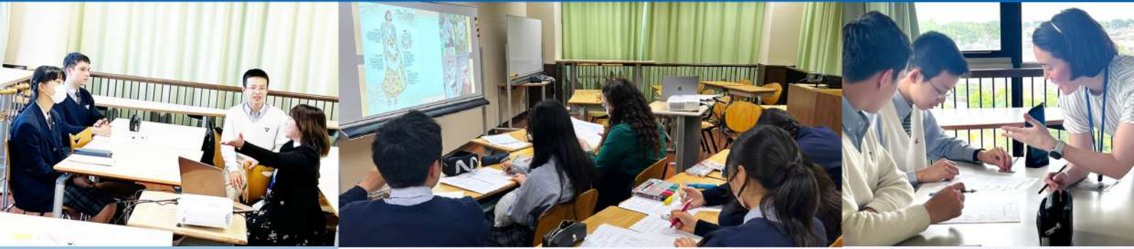
Students dive into global perspectives with the launch of Global Cultures and Global Voices .