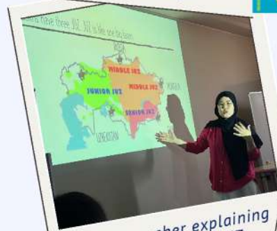
Kazakh teacher explaining the 3 types of JUZ