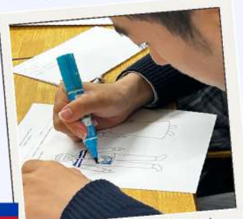
Student creating a modern twist on Barong Tagalog