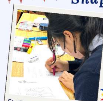
Student designing a modern take on Baro't Saya