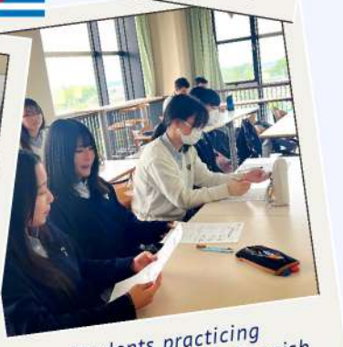
Students practicing self-introductions in Spanish