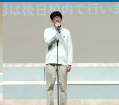
TNUSS students singing their hearts out on stage!