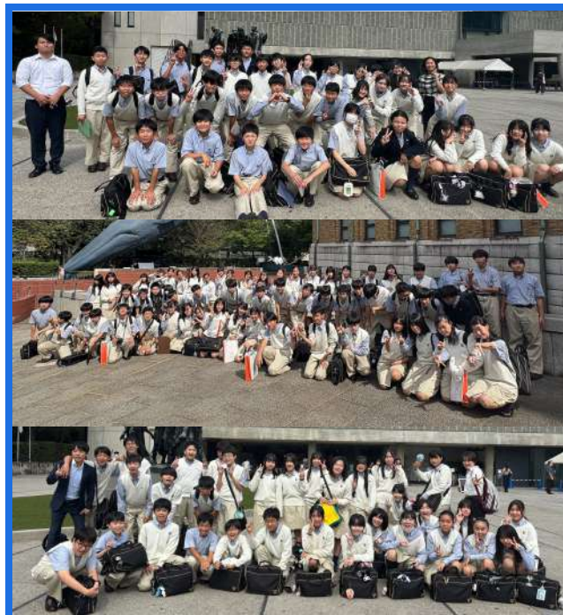
Form 1 Day of Discovery at the Ueno Museums

The day was an opportunity to experience science and art side by side, reminding students that learning is not limited to classrooms. Knowledge and inspiration can be found in every fossil, painting, and idea waiting to be discovered.