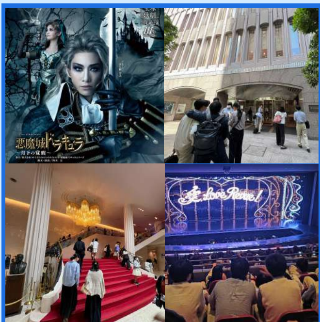
Form 4 Theater Day in Tokyo

Together, the two shows gave students both a serious story and a fun, sparkling revue. All the roles, both male and female, were played by women—one of the special traditions of Takarazuka. The theater was full, and the three-hour performance was an unforgettable experience.